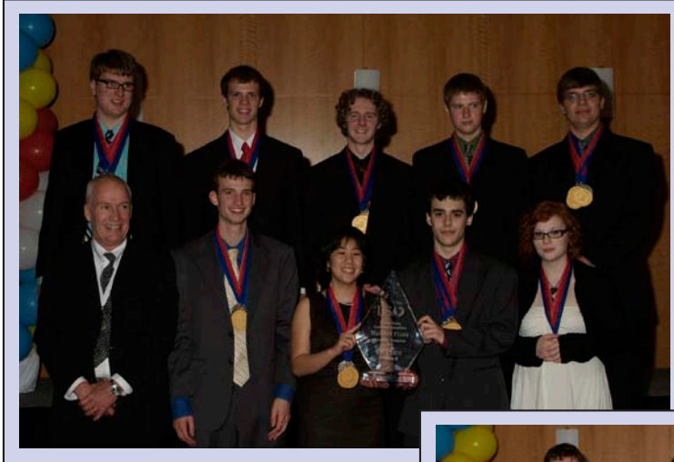
USAD 2009 National Competition - Division II, Wisconsin, 1 st place winners