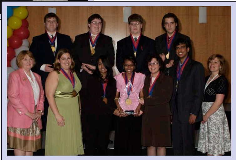
USAD 2009 National Competition - Division III, Pennsylvania, 1 st place winners