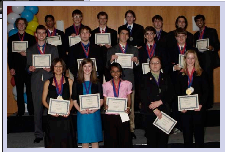
USAD 2009 National Competition Overall Scholarship Winners