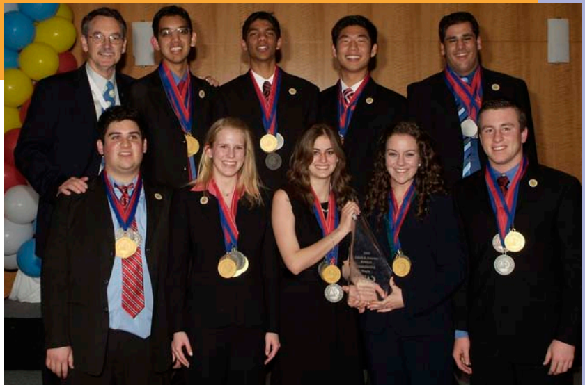
Moorpark HS, California National Champions