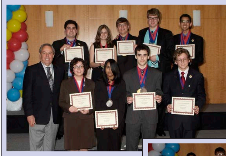
USAD 2009 National Competition Hilton HHonors Overall Scholarship Winners