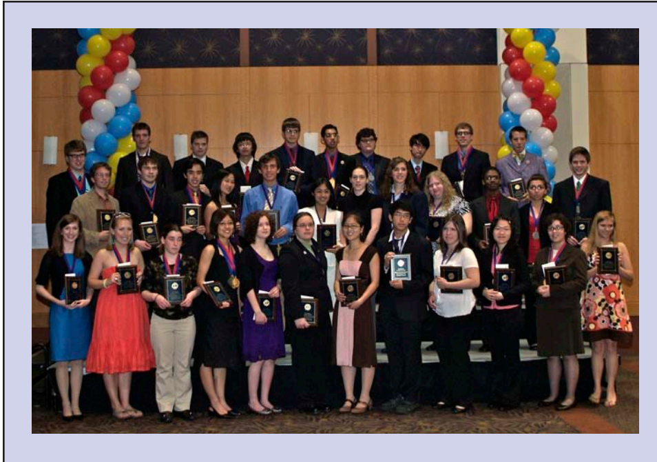
USAD 2009 National Competition Highest Scoring Students